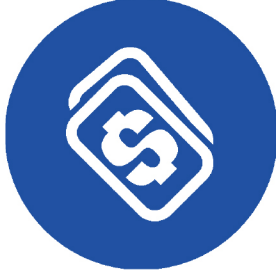
Value For Money